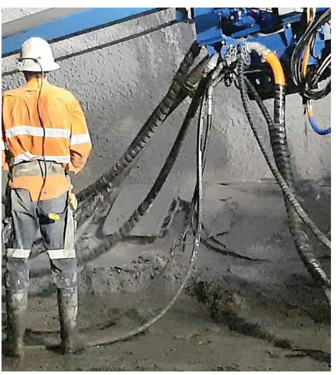
Xypex treated concrete being applied using shotcrete.

After that, a layer of Xypex-treated shotcrete was applied directly onto the primary lining, which serves as both the secondary lining and the waterproofing for the tunnel. This portion of the West-Connex project used a total of 5,578 m3 of Xypextreated shotcrete for these purposes.